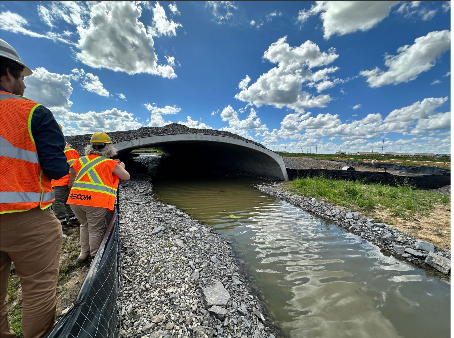
Photo 1. June 2024 Site Tour-Eco-passage